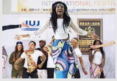
International Festival (Annual school event)