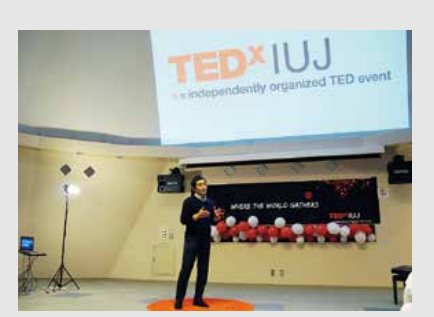
TED X IUJ